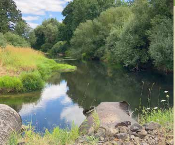
Roughly 400 mounds are thought to be within the Calapooia River watershed, though only 22 sites have been formally recorded.

of Grand Ronde to create a predictive model to locate these features across the Calapooia River watershed using LiDAR (light detection and ranging) data. LiDAR uses aircraft-mounted lasers to scan the surface to create 3-D models.